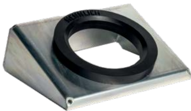
Accumulator mounting bracket HBBZ-K-GK