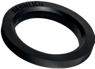
Rubber ring HBBZ-GK

The HENNLICH rubber ring is the ideal base for the rounded accumulator body. The rubber material has a vibration-damping effect and compensates for expansion of the system.